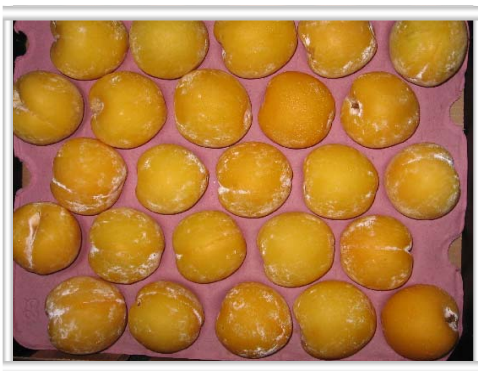
Figure 6: Skin colour of Sun Supreme plums harvested at a flesh firmness of 10.2 kg, after cold storage according to a PD 9 dual temperature regime and ripened thereafter for 5 days at 20°C