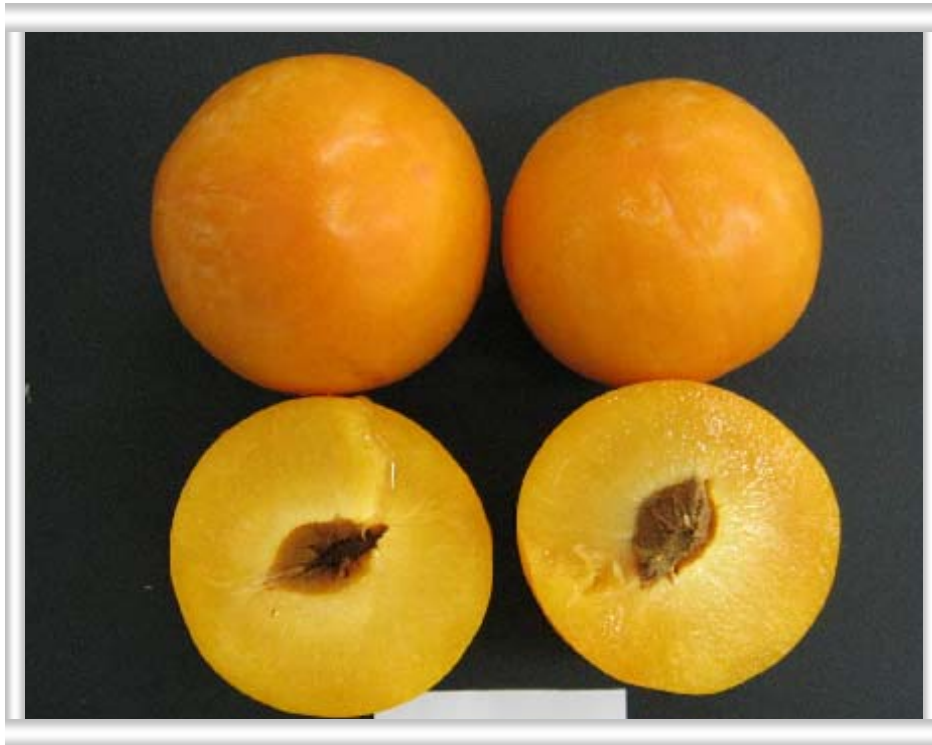
Figure 7: Internal and external appearance of Sun Supreme plums harvested at a flesh firmness of 10.2 kg, after cold storage and ripening for 10 days at 20°C