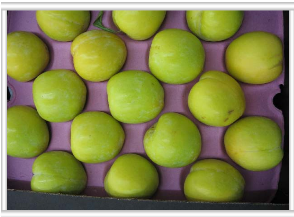
Figure 4: Typical skin colour of Sun Supreme plums harvested at a flesh firmness of 10.2 kg