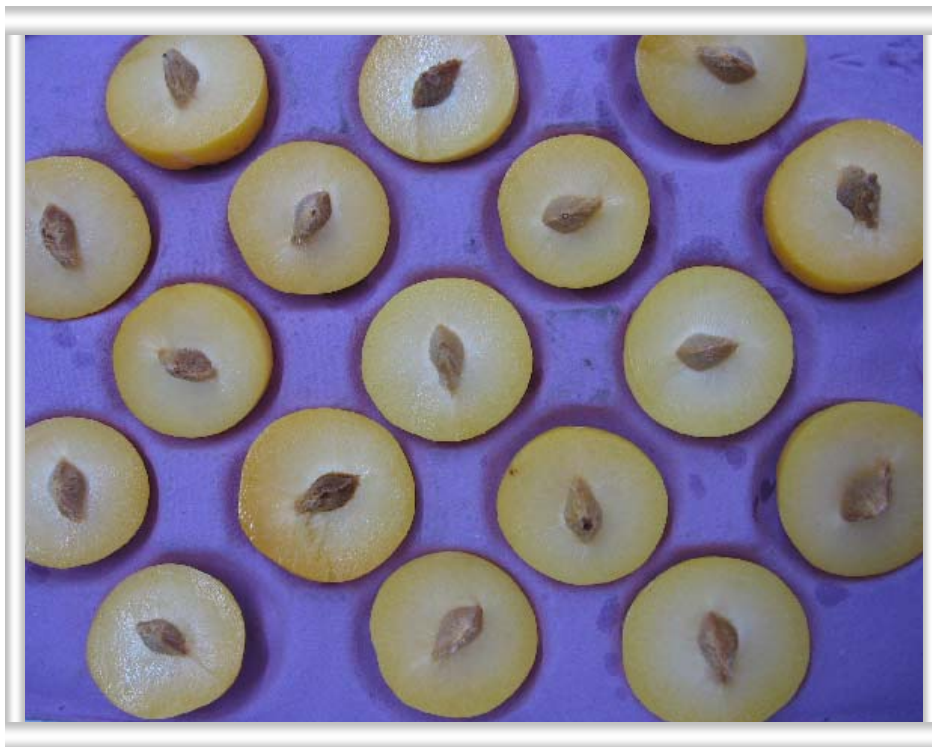
Figure 5: Internal quality of Sun Supreme plums harvested at a flesh firmness of 10.2 kg, after cold storage and ripening for 5 days at 20°C