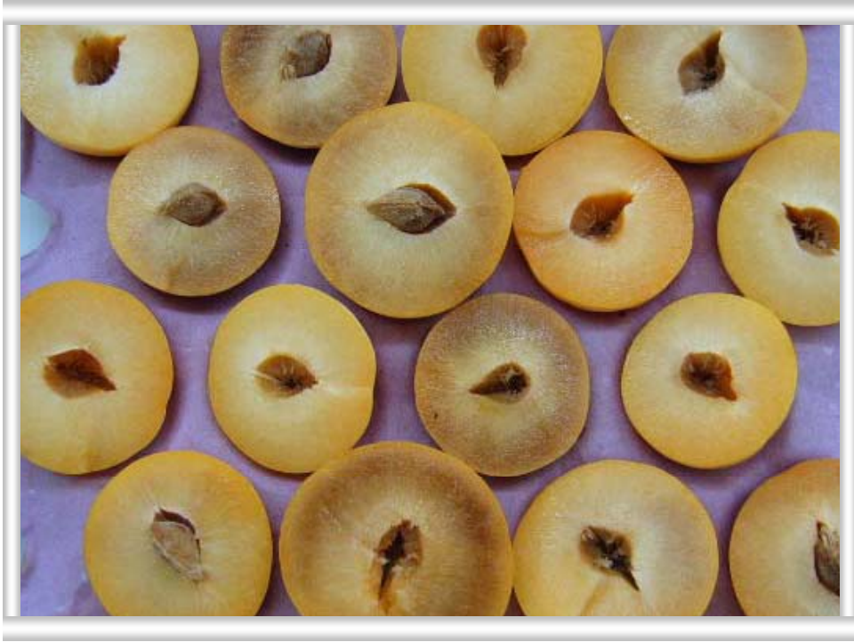
Figure 3 : Internal browning in Sun Supreme plums stored at a single temperature of -0.5^{\circ}\text{C}