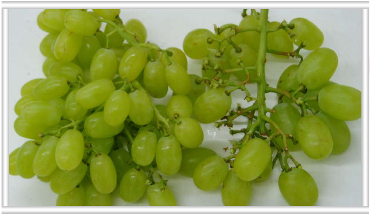
Figure 4: Variation in browning incidence between individual grape bunches from the same box as indicated by the healthy berries remaining on the rachis after removal of all berries exhibiting browning symptoms