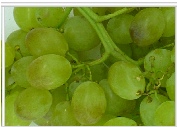
Figure 1: Various types of berry browning symptoms on white seedless grapes, showing mottled (top), peacock (centre) and a mix of net-like and glassy berry browning